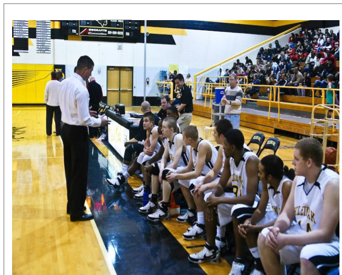
A Team of Hard Workers are always Champions!!

Oct. 29th begins our second phase of our Journey,